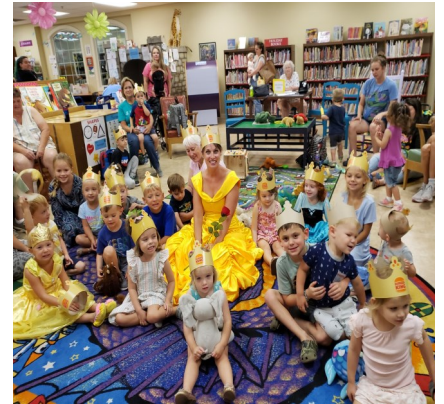
Princess Belle came to visit for a Preschool Storytime, too!