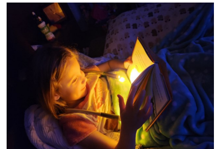
Harper Mellott reading by flashlight.